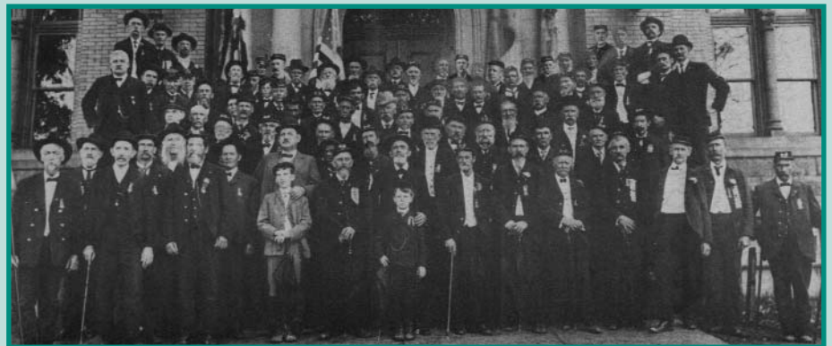
Members of the Thomas Espy Post of the Grand Army of the Republic in front of the library in 1905.