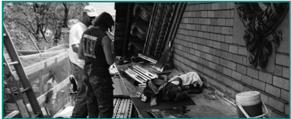
Construction workers toil in the eaves of the library and music hall during Phase II of the restoration project.