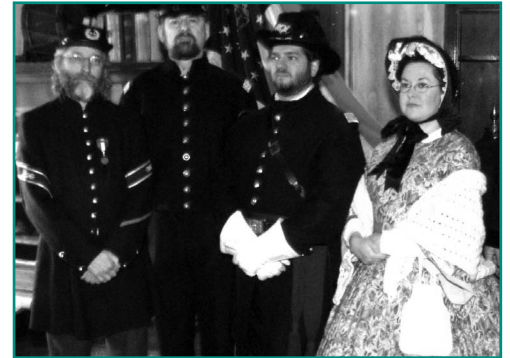
Members of the 9th Pennsylvania Reserves in uniform inside the Civil War Room alongside a woman in period dress. The Civil War Room is one of many areas available for special funding through the ACFL&MH capital campaign.

Other naming opportunities are available through the Andrew Carnegie Free Library & Music Hall Campaign to restore, renovate and revitalize the historic landmark. Donors have already committed to four prominent areas – the Main Reading Room, Children's Room,