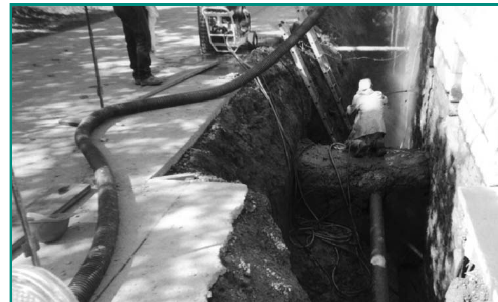
Construction workers toil in the trenches around the Library and Music Hall. Phase II construction, which began in the fall, is designed to get the water out and keep it out.